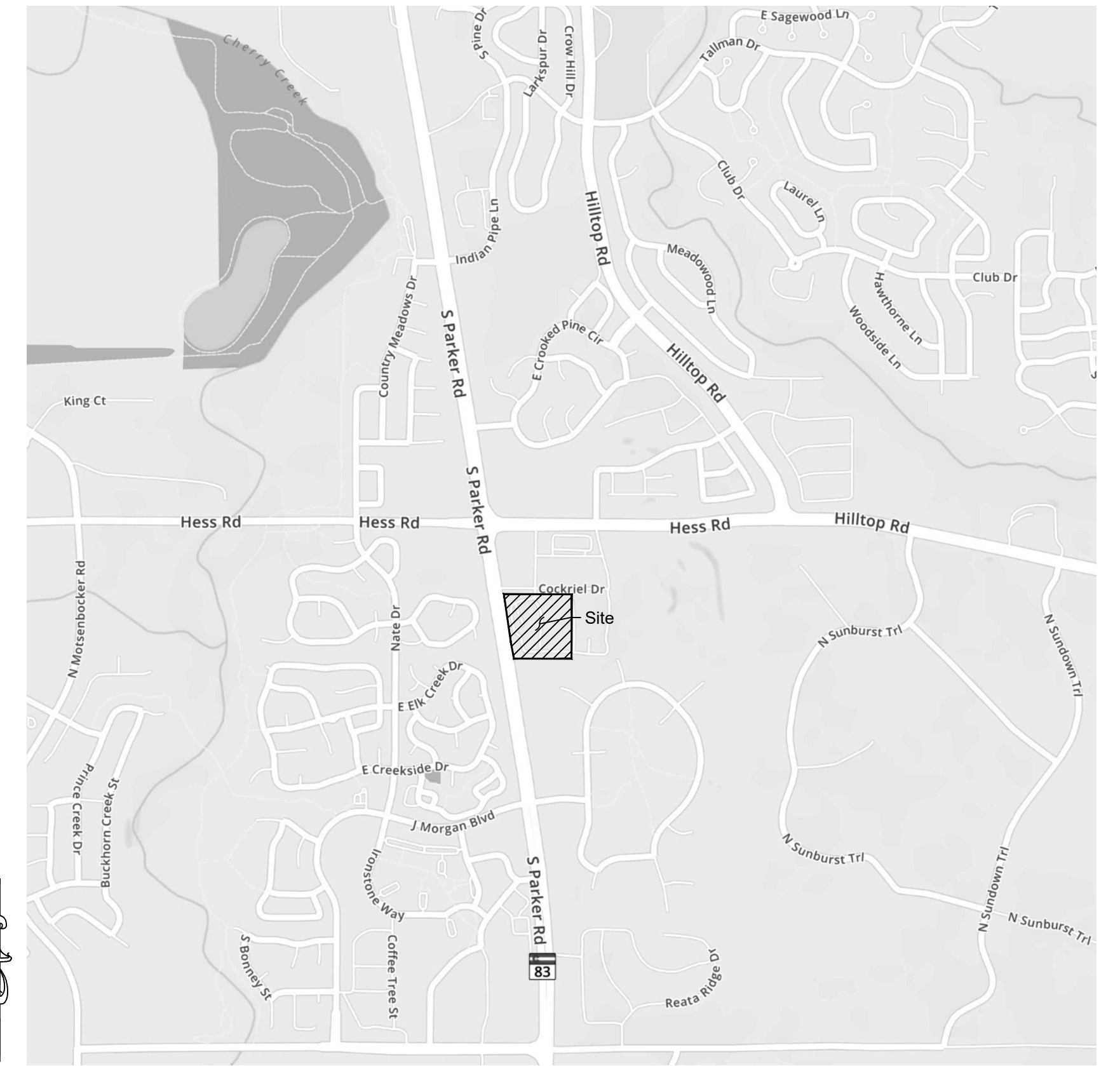
vicinity map scale 1"=1200'