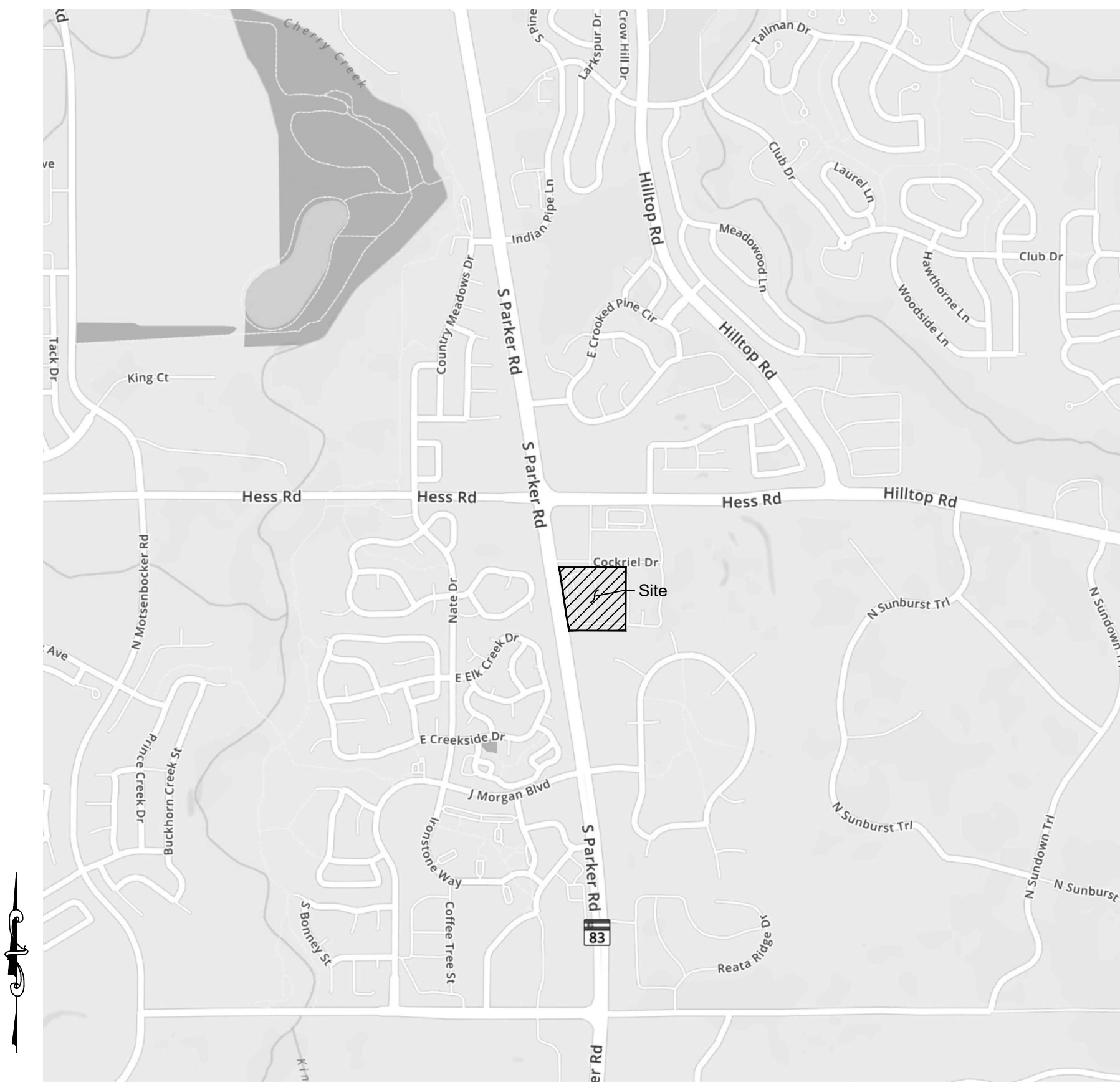
vicinity map scale 1"=1200'