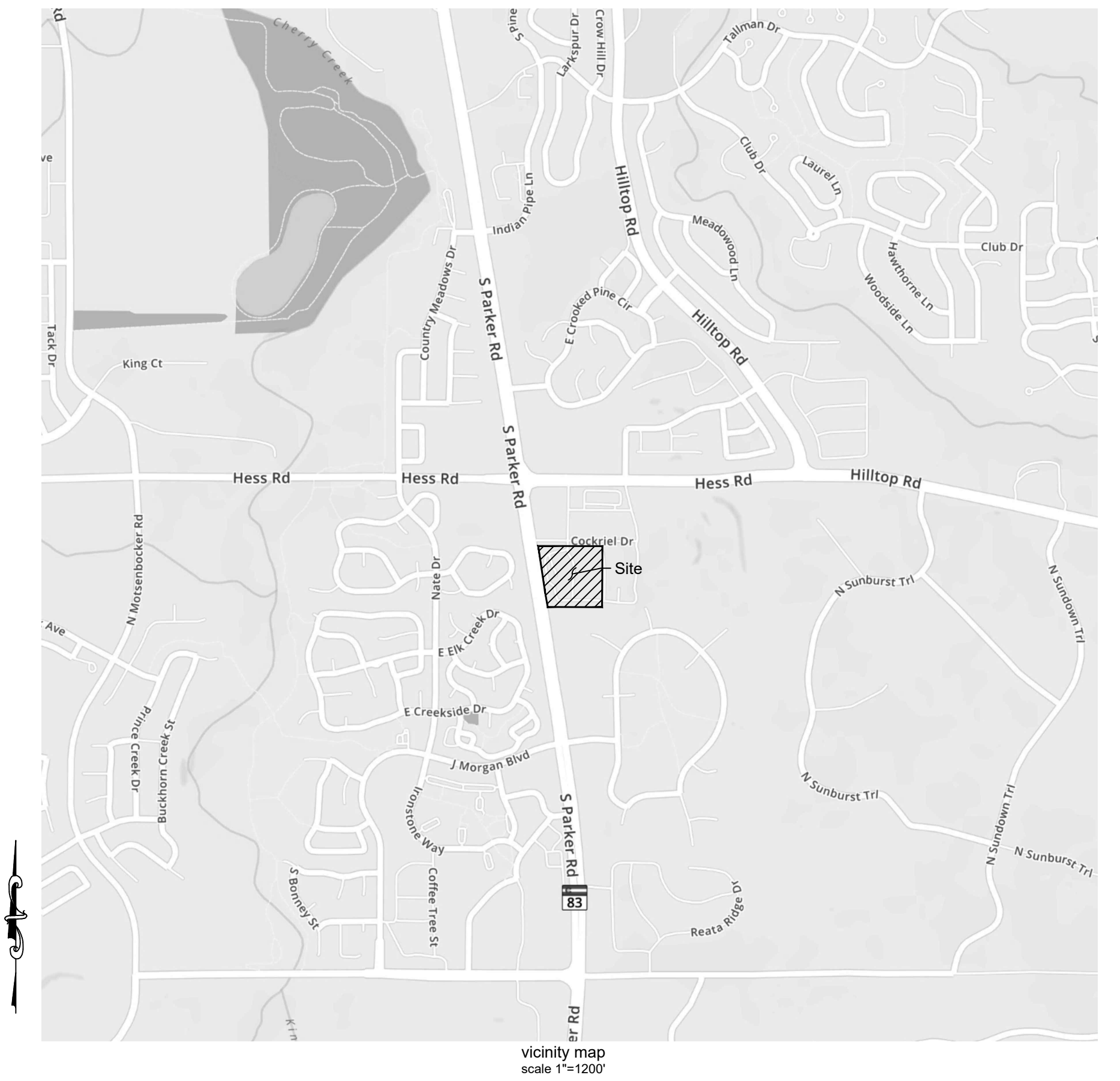
vicinity map scale 1"=1200'

Lot 1, Block 1 and Tract A, Jackalope Subdivision, Filing No. 1 Part of the Northeast 1/4 of the Northeast 1/4 of Section 34, Township 6 South, Range 66 West of the 6th P.M. Town of Parker, County of Douglas, State of Colorado